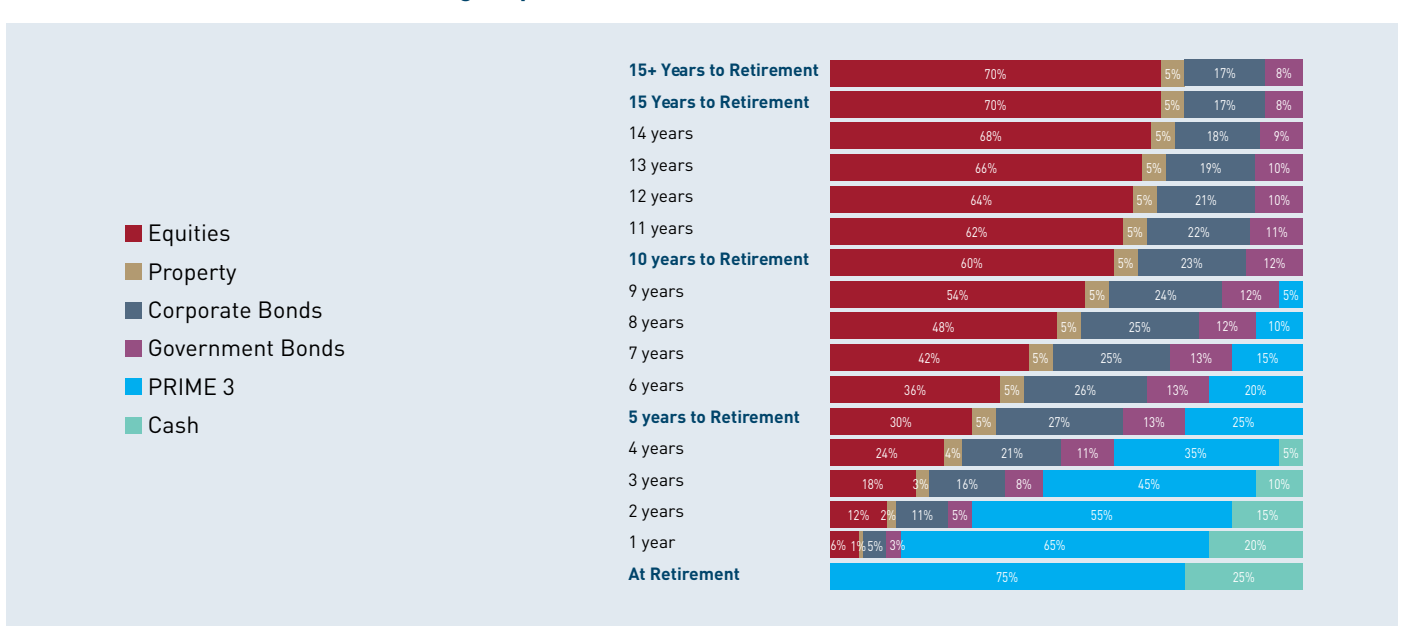
Chart 1: Passive IRIS asset allocation glidepath