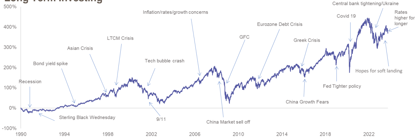
Source Bloomberg, October 2023, reflects the price performance of the MSCI All Country World Index relative to a 1/1/1990 starting point.

Warning: Past performance is not a reliable guide to future performance.