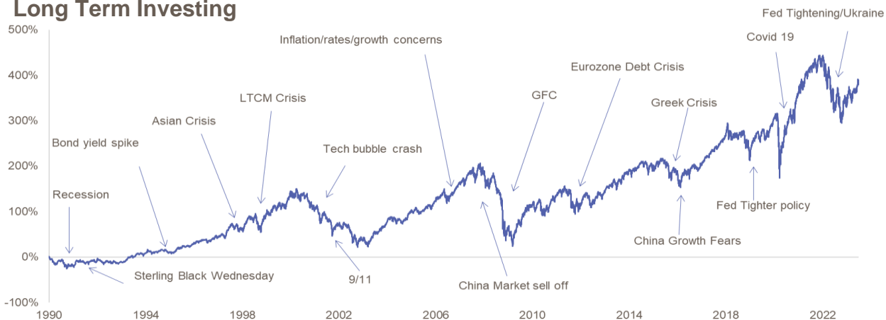
reflects the price performance of the MSCI All Country World Index relative to a 1/1/1990 starting point

Warning: Past performance is not a reliable guide to future performance.