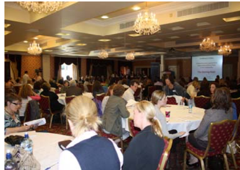
Delegates at the Event