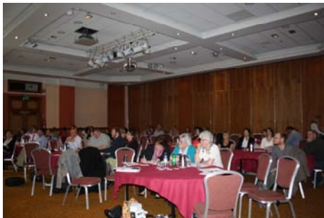
Delegates at the Event

Following on from the Masterclass Series the National Federation of Voluntary Bodies hosted a Sharing Innovative Learning Seminar on 11 th May 2011 in the Tullamore Court Hotel. The aim of this event was to present mainstream technology that supports people with intellectual disability to lead ordinary lives and also to discover the specialist advances of technology that are going to change the way we live in years ahead. This event was very well attended and the feedback was very positive. The presentations from this event are all available on our website www.fedvol.ie for download