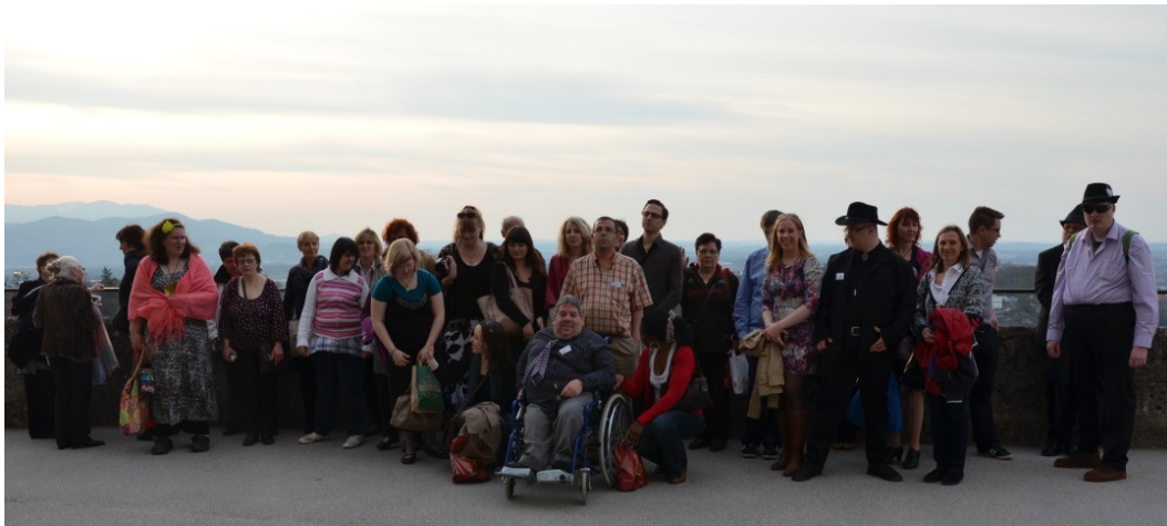
The final night of the European Project being celebrated at Salzburg Castle in Austria

Through the mobilities in the Journey to Belonging Project we used a variety of innovative techniques to transfer skills and knowledge including participatory strategies for including people with intellectual disability.