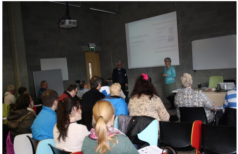
IRN Training Day 31st March, 2014 in University of Limerick

Training Days have taken place over the past number of months in UL in Limerick where IRN members were trained how to be co-researchers. At previous IRN meetings role play had taken place and a video was recorded to be used for training purposes. Everyone took part in role play of each question on the Interview Sheet. The members decided which questions they wanted to ask. At the final Training Day on 31 st March there was positive feedback about having the video at the training and people found it very helpful. The handbooks have been sent to the co-researchers to begin their research.