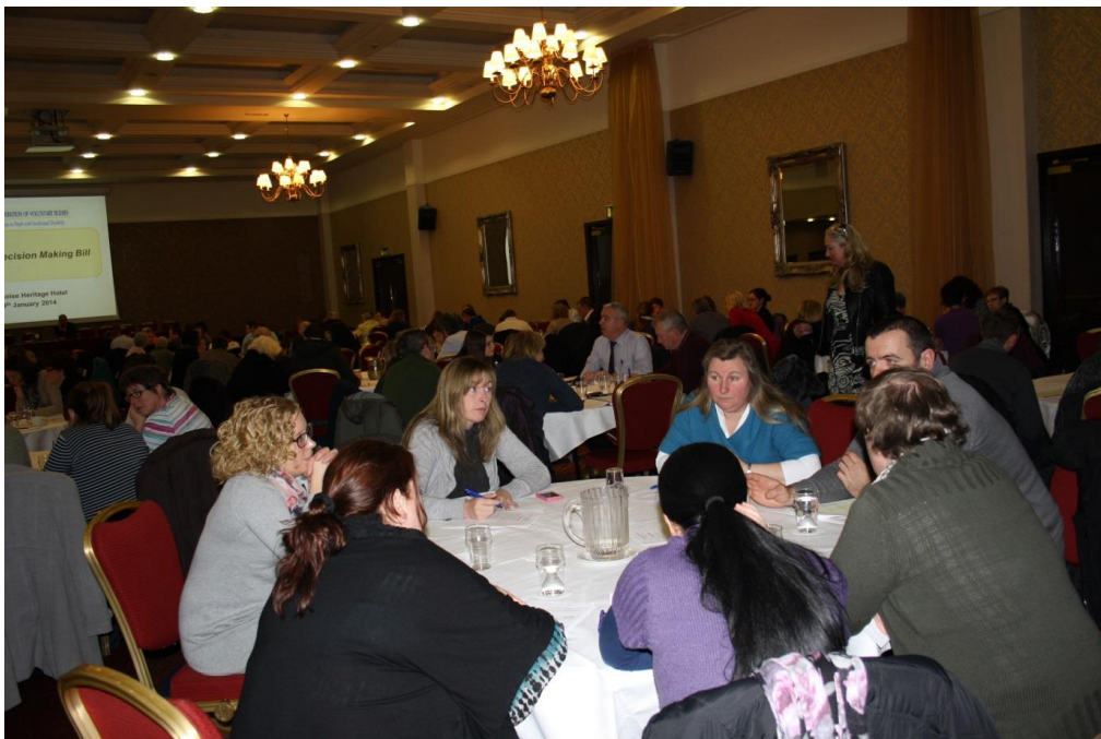
Roundtable discussions at the event on the Assisted Decision Making Bill.

In the afternoon during Roundtable Discussions there was an opportunity for delegates to discuss the key issues raised at the event. A lively discussion took place outlining the obstacles that exist to supported decision making and how they can be overcome. The National Federation is an active member of the Legal Capacity Coalition seeking progressive legislation in this area.