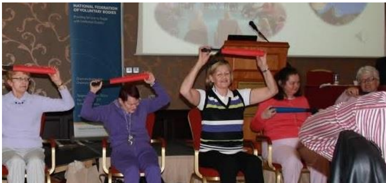
Go for Life! Supported by Cheeverstown House demonstrating their community approach to exercise.

can be used to empower and enable independent living.