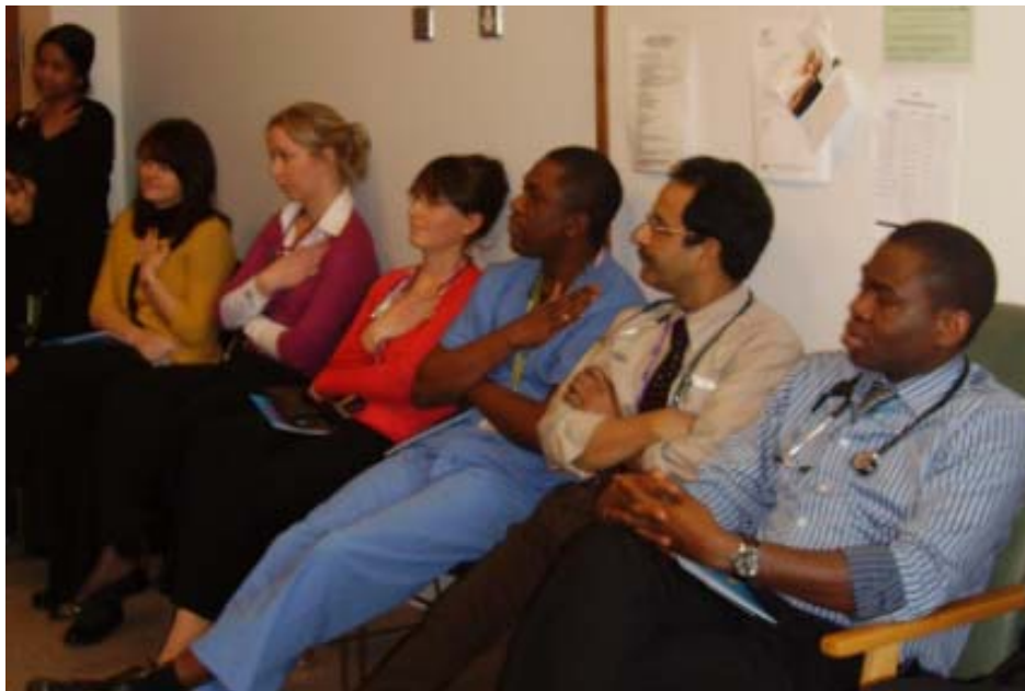
Non-Consultant Hospital Doctors from the Neonatal and Paediatric departments in Cork University Hospital and Cork University Maternity Hospital take part in training