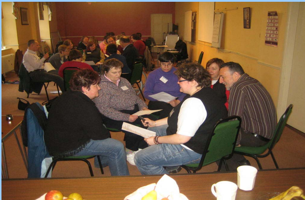
Members of the Inclusive Research Network practice their interviewing skills at a Galway workshop held in November 2008.