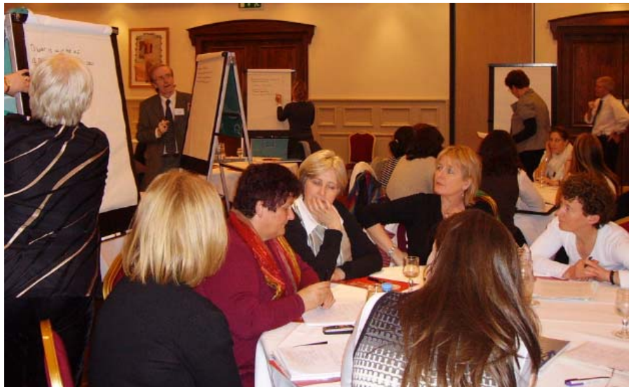
Participants busy at work in a group session of the 'Supporting the Effective Transfer of Learning' event