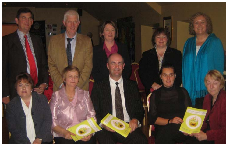
Pictured at the Volunteering Launch